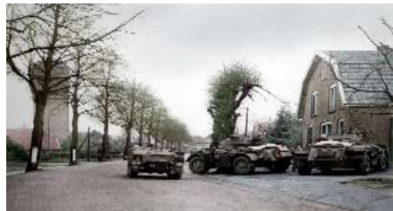
Canadian troops at the Terborgseweg, 1 April 1945

On Easter Sunday, 1 April they reached the city via the Terborgseweg and were met on the eastern outskirts by members of the resistance. After a short consultation, a big force surrounded the town and the Canadians continued to the centre. They met with considerable resistance and the Germans had blocked the roads with trams, filled with concrete. The Canadians used flamethrowers and other weapons to try and disable the enemy. Dozens of Germans were killed and many buildings were burned out. Nine Canadian lives were lost. Not until the following afternoon, 2 April, was Doetinchem liberated.