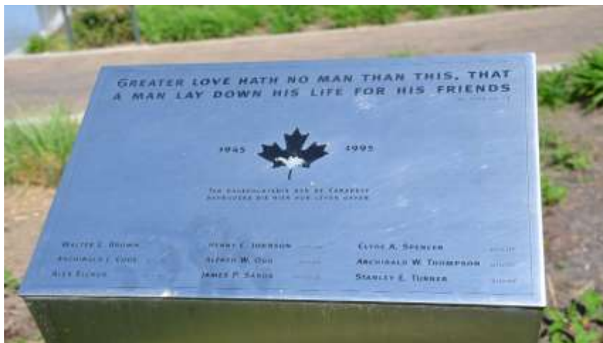
Monument at the Mark Tennant Plantsoen, Doetinchem

BLESSED ARE THE PURE IN HEART FOR THEY SHALL SEE GOD