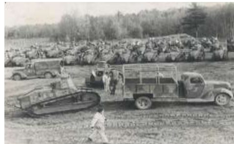
Camp Borden, 1940

In November he was transferred to Camp Borden also in Ontario to continue his training and during the almost five months stay there he qualified as a class 3 driver and finished off his training as a mechanic; he was now considered suitable for service overseas. He was given a short Christmas leave.